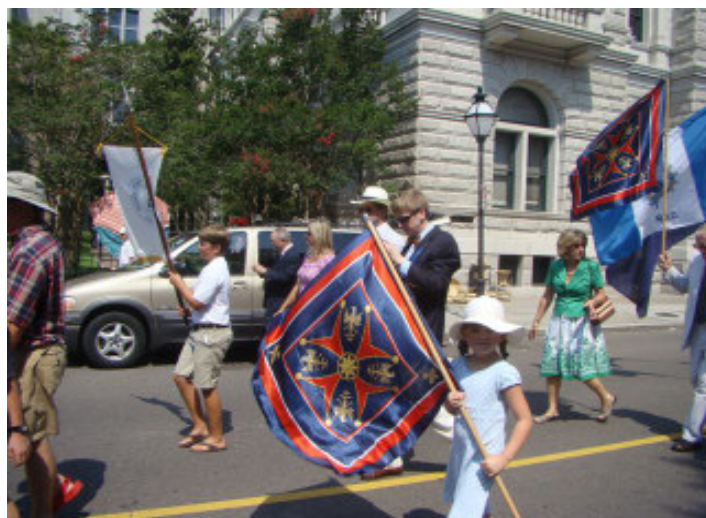
Society members celebrate Carolina Day