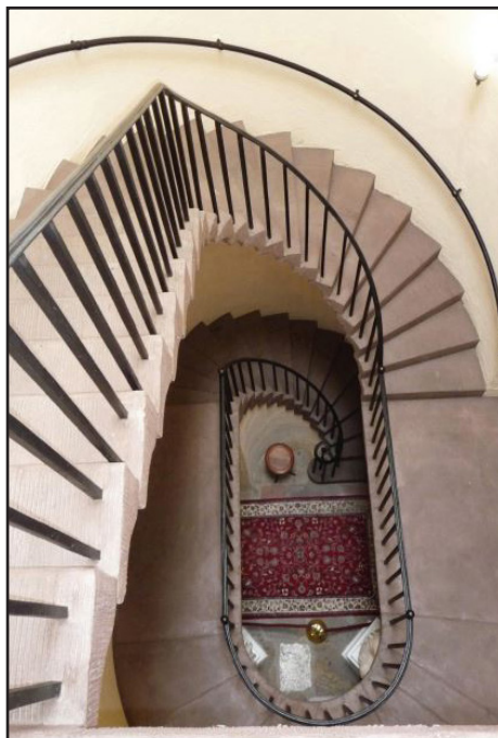
Staircase of the Fireproof Building